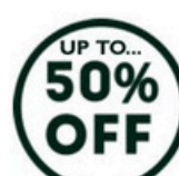
Discount On School Fees (If Relevant)