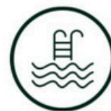
Use of Pool