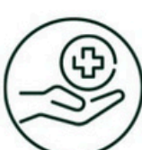
Employee Assistance Programme