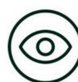
Eye Care Vouchers