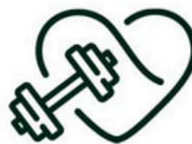
Use of Facilities