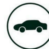
Free Parking Where Available