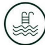
Use of Pool