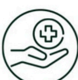
Employee Assistance Programme