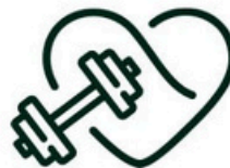
Use of Facilities