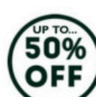
Discount On School Fees (If Relevant)