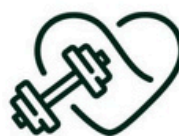
Use of Facilities