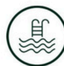
Use of Pool