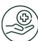
Employee Assistance Programme