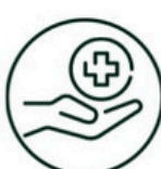
Employee Assistance Programme