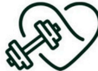
Use of Facilities