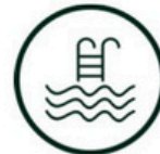
Use of Pool